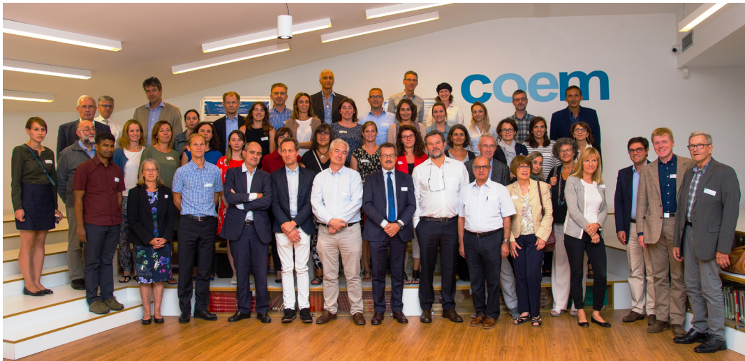
Participating experts, young scientists and TRANSCAN-2 representatives of funding organizations and Scientific Advisory Board

This event was the first opportunity for the project coordinators to meet the representatives of the funding organizations. During this meeting, the coordinators were able to express themselves in a non-scrutinizing environment on the process of implementing their project and working in a consortium funded by TRANSCAN. This face-to-face meeting allowed both sides to better understand the processes that might hinder the excellent science conducted. A number of issues were raised and discussed by the project coordinators and experts, which are relevant for the successful outcome of the project.